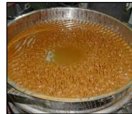
Fruits concentrated juice