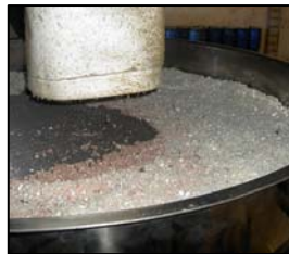
Paper and plastic recycled